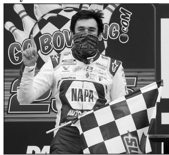
Elliott Gets Daytona Road Course Win