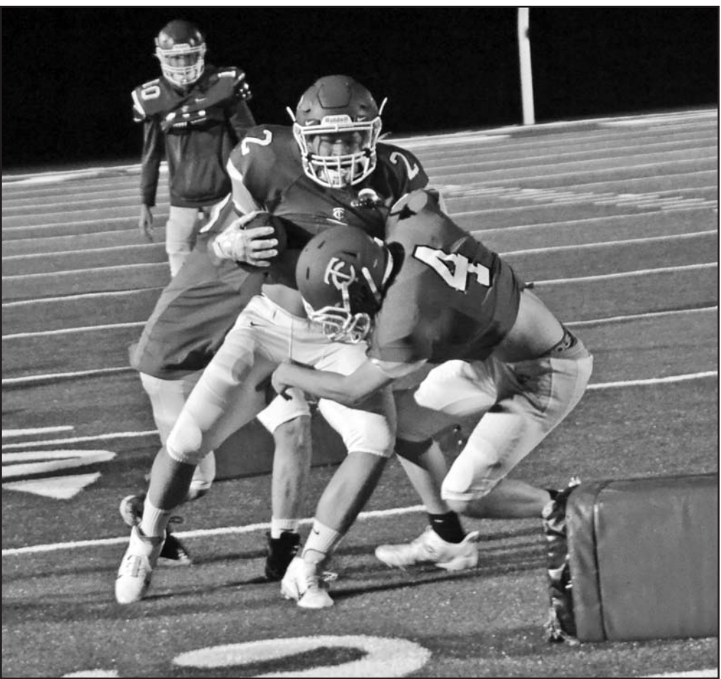
The Towns County Indians hosted their first official practice of 2020 at midnight on Aug. 7. Despite scrimmage games getting the axe, the season is still tentatively scheduled to open Sept. 4.